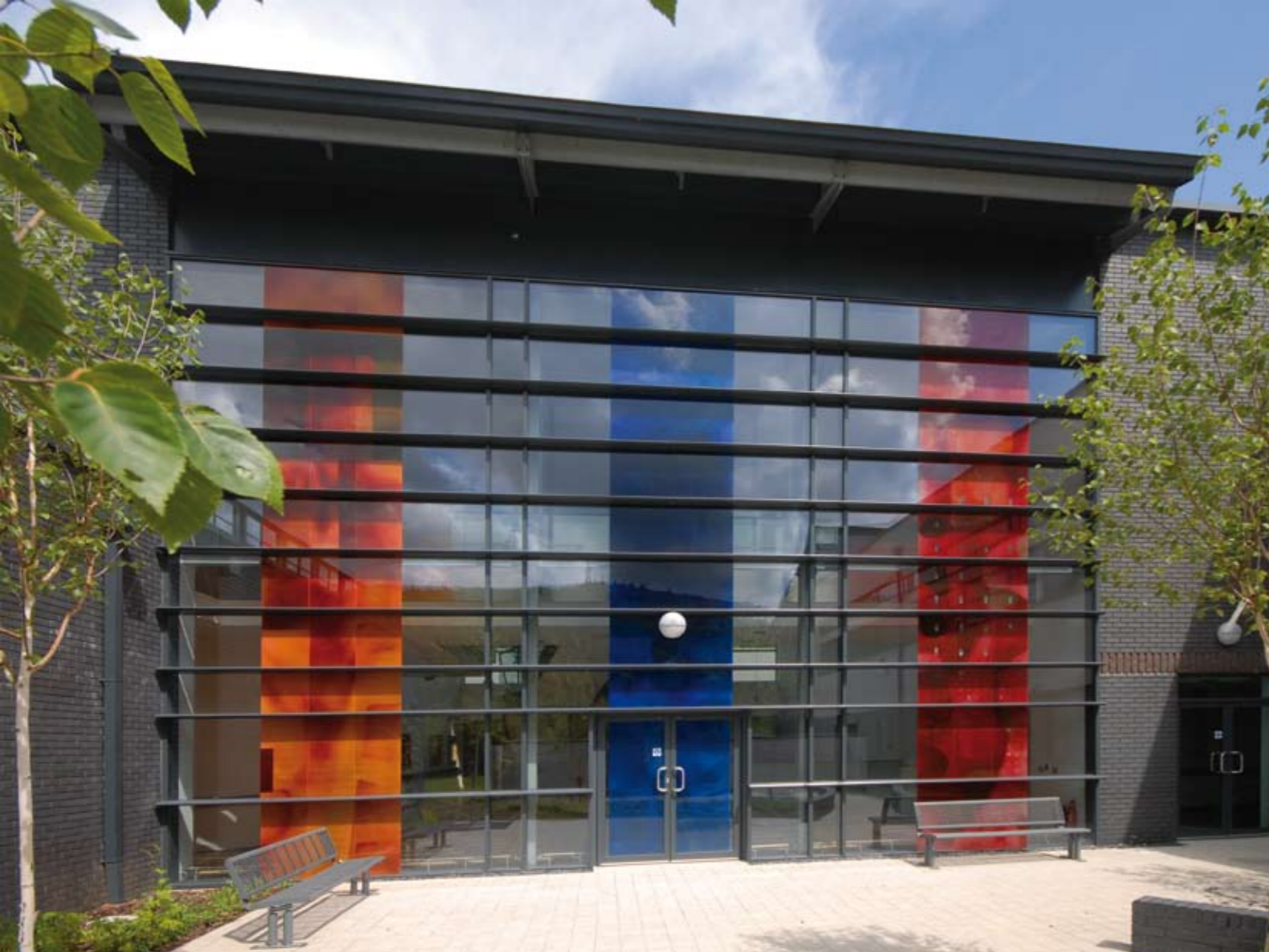
Etched and painted mouthblown Antique-glass, laminated on toughened glass