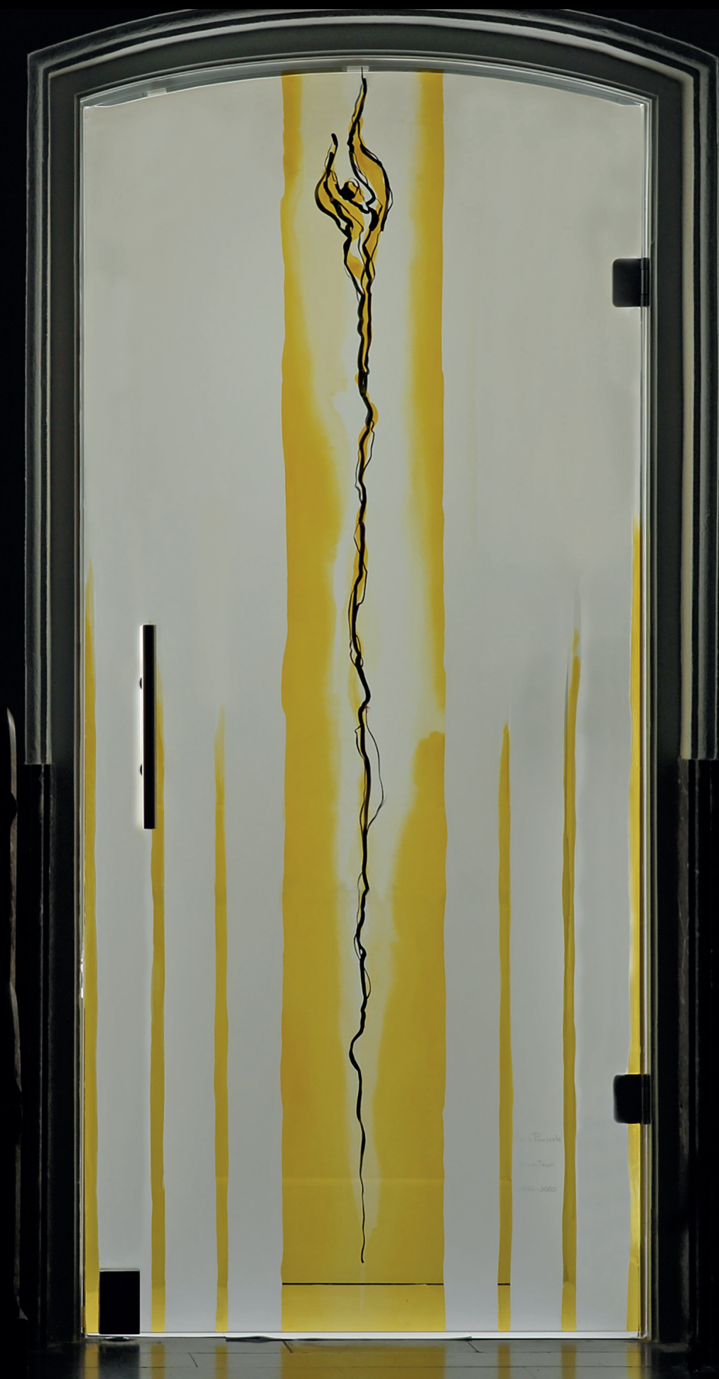
Klein-Seminarie, Roeselare, B