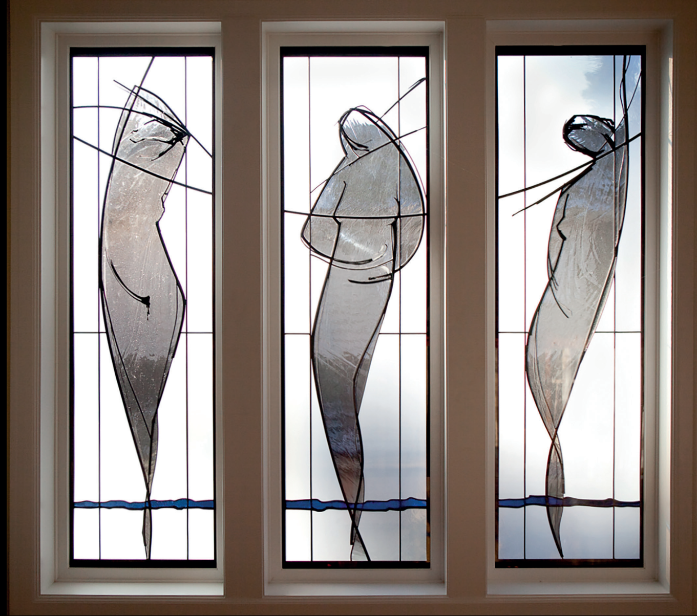
Private House, Seattle, US