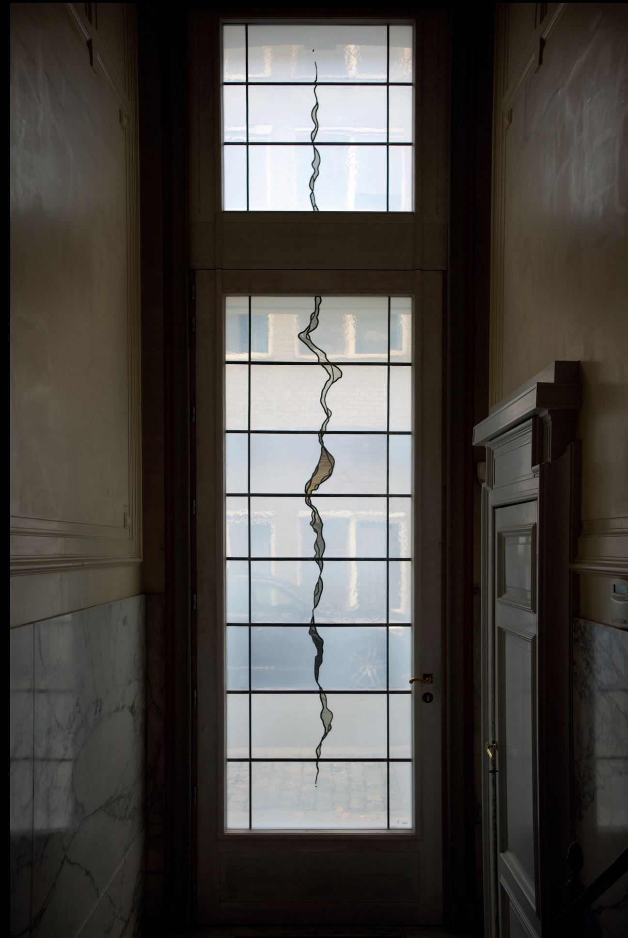
Private House, Antwerp, B