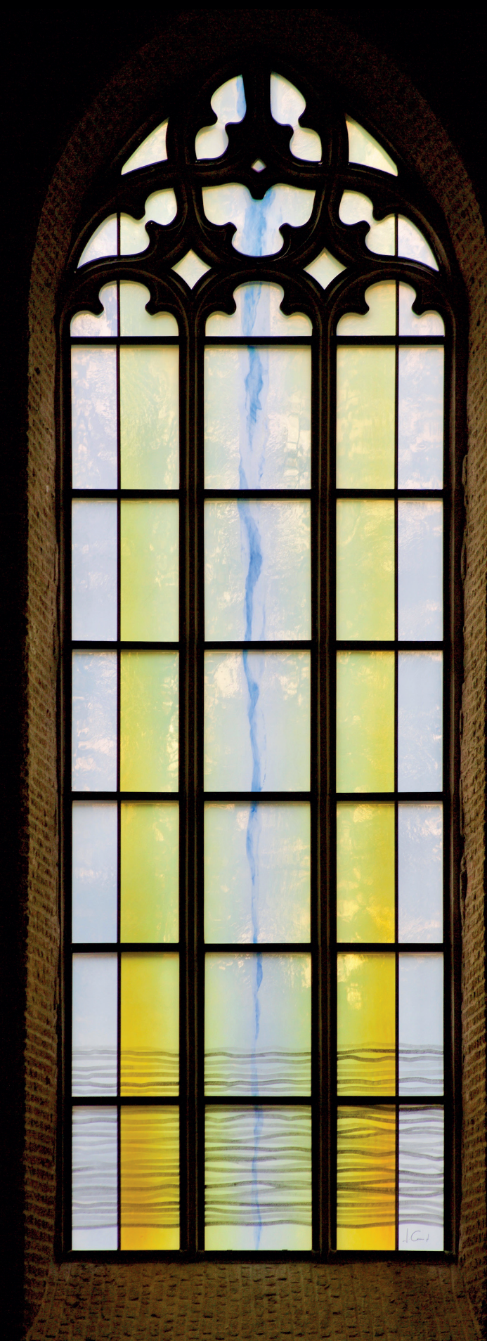
St Laurentius Church, Hove, B