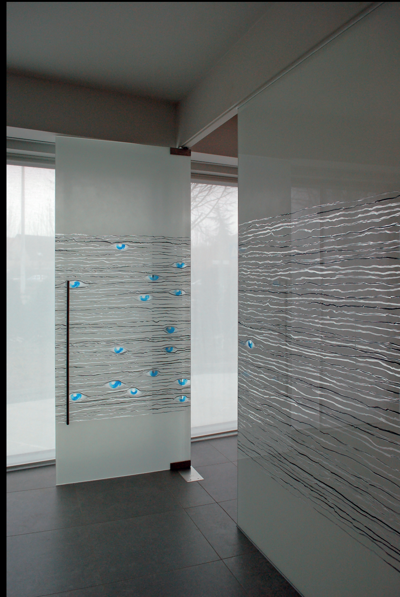
Opthalmological Practice, Lier, B