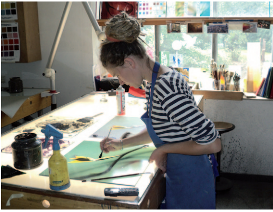
Painting in the studio